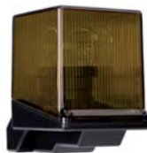
Flashing lamp Faalight 24 V dc