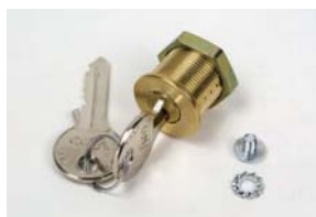
Release lock with customised key from no. 1 to no. 36 (*)