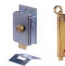
Various accessories page 168