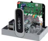
Control board E720 and E721 incorporated Technical specifications page 144