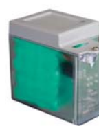
Emergency battery kit XBAT 24 (not for E 124)