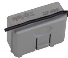
Receiver XF433 Mhz Receiver XF868 Mhz